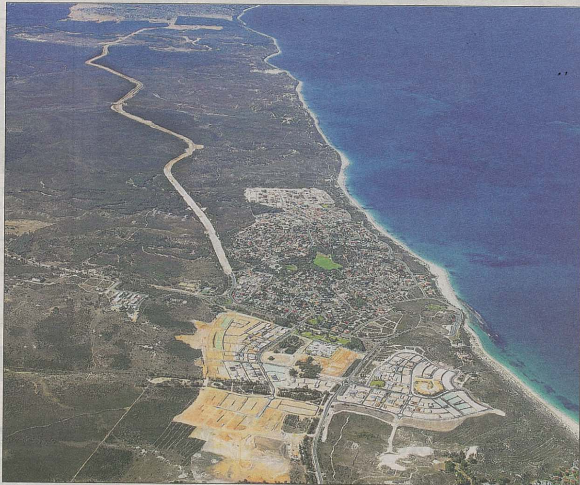
Early days: The coastal community of Yanchep is beginning to take shape north of Perth.